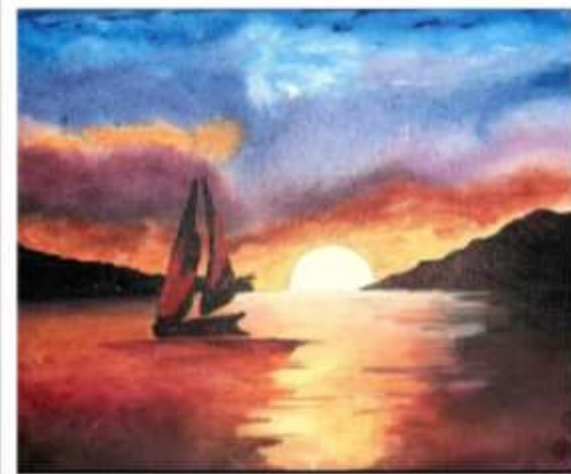
Riddhi Jain 12 F