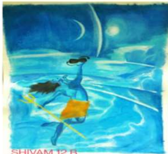
SHIVAM 12 B