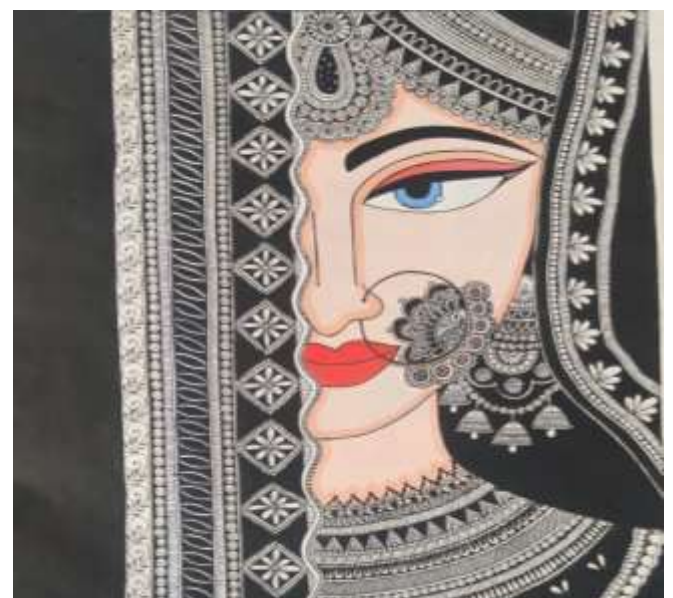
Sakshi 12 D